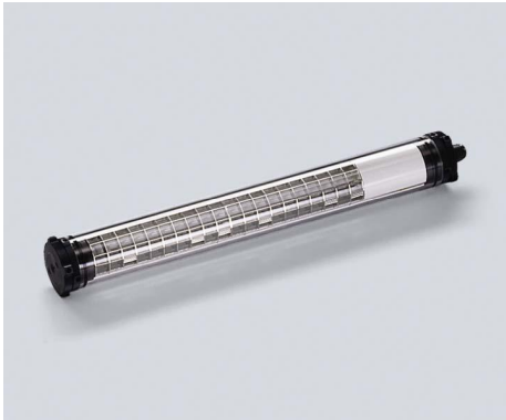
RL70CE- 124 H